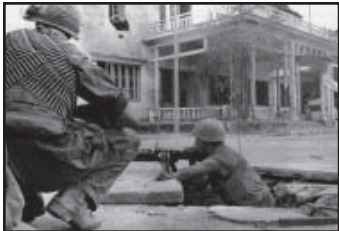
Marines battle through Hue City in the 1968 Tet Offensive