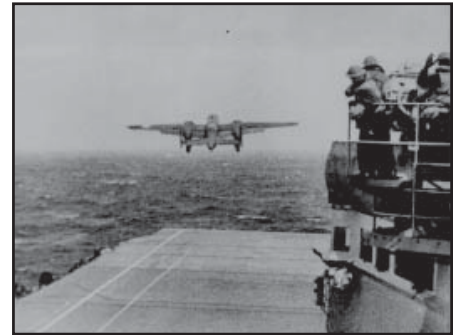
A B-25 bomber takes off from the USS Hornet as part of the Doolittle Raid on Japan - April 18, 1942.