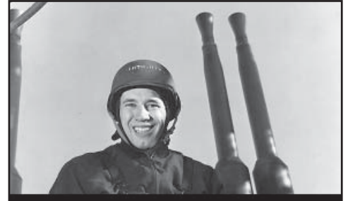
Bob Feller on board the USS Alabama, where he led an anti-aircraft gun team. Feller, like many other Major League Baseball players, left the game to serve in the military during World War II.

NOTE: Bus transportation departs at 5:45 PM from the Renaissance Washington Hotel. Meet in hotel lobby (K Street side of hotel). Bus will return to Renaissance following the reception.