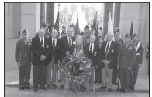
The Doolittle Raiders lead the wreath laying ceremony at the WWII Memorial at the AVC's 2006 conference.